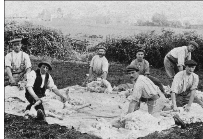
Above: Sheep shearing at Upwey in 1909.