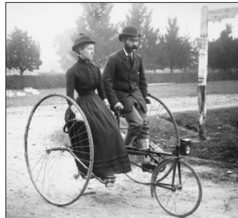
'Sociable' tricycle and riders from Christchurch, at the finger-post on Balmer Lawn – 7 miles from Beaulieu – in the 1880s.