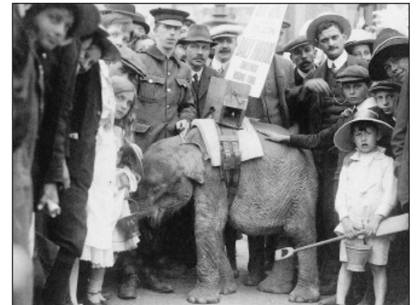
Soldier and Baby Jumbo collecting for the Daily Mirror Christmas pudding appeal, on Bournemouth beach, in 1912.